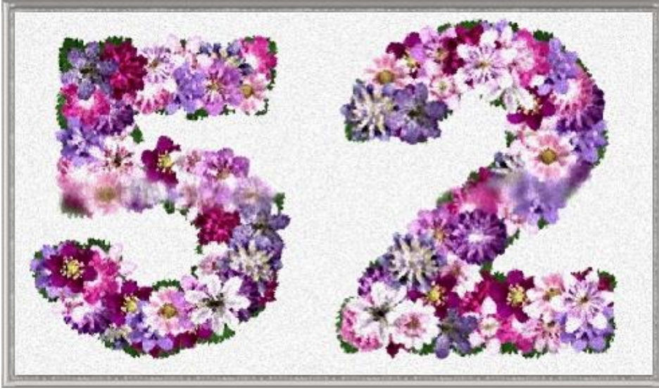
Sijill 52 - first anniversary on milad of 52 nd Dai Syedna Mohammed Burhanuddin RA