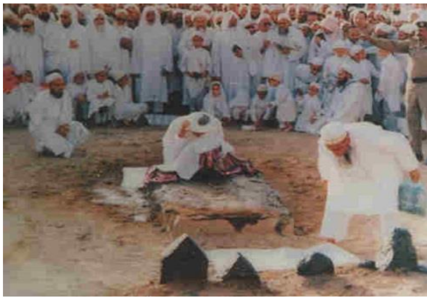
Syedna Burhanuddin RA & Syedna Qutbuddin TUS perform Imam Hasan ziarat in Jannatul Baqi'